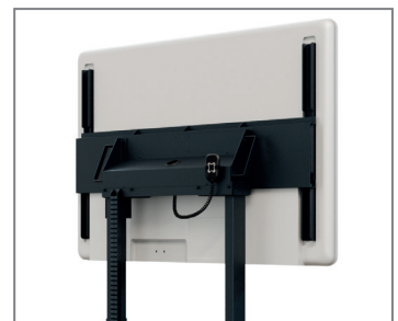
Hole pattern display-specific optimised