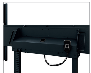
Cable management via cable drag chain